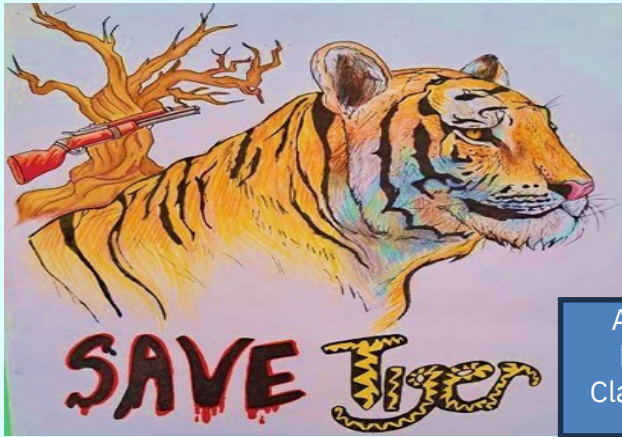
Atrayu Barat Class-VIII